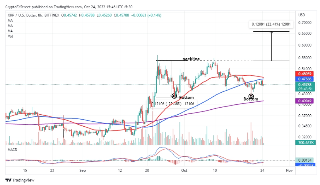
XRP/USD four-hour chart

If the double-bottom pattern holds, the price of XRP might rise by as much as 45 percent.