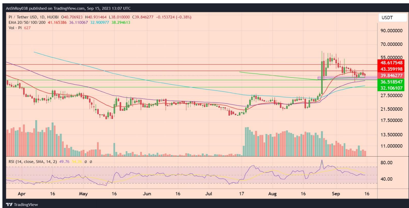
PIUSD daily price chart with RSI

If the nearby support fails, however, PI price may head toward the $32 support area marked by the 100-day exponential moving average (blue wave).