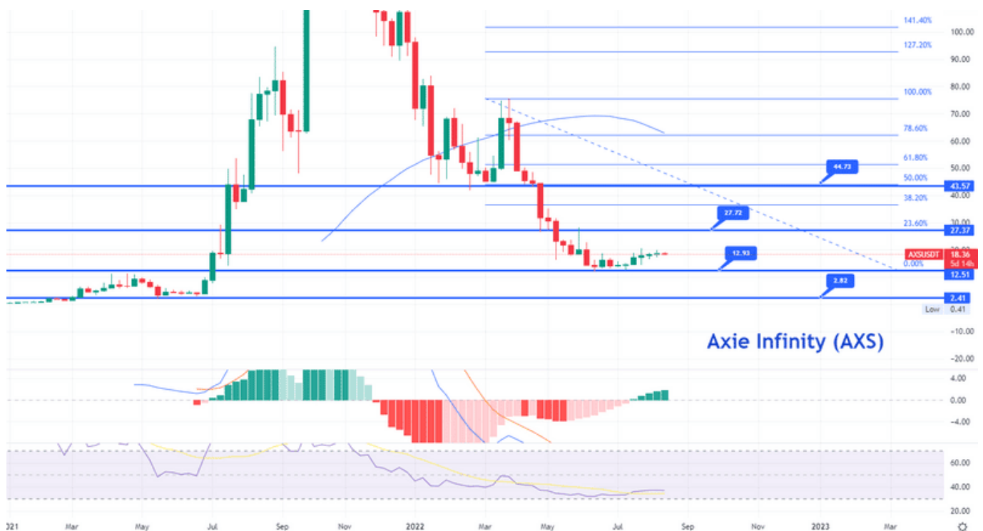
Axie Infinity Price Chart

Axie Infinity is trading at $18.32 right now, with a 24-hour volume of $168 million. The value of Axie Infinity has increased by 0.60 percent over the past 24 hours. With a current market worth of $1.5 billion, CoinMarketCap has risen to the #40 spot. The total supply of AXS coins is 270,000,000, and currently there are 83,814,110 in circulation.