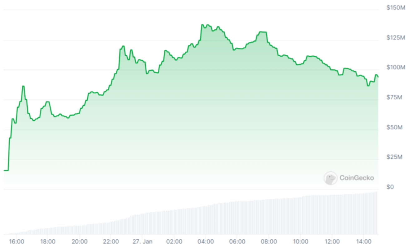
Solana WEN Meme coin

The value of the meme coin skyrockets within a day of this profit being realized. Since its introduction on January 26, the WEN token's price has increased by an astounding 500%, reaching a peak of $0.00013781 before retracing to $0.00009401, according to CoinGecko.